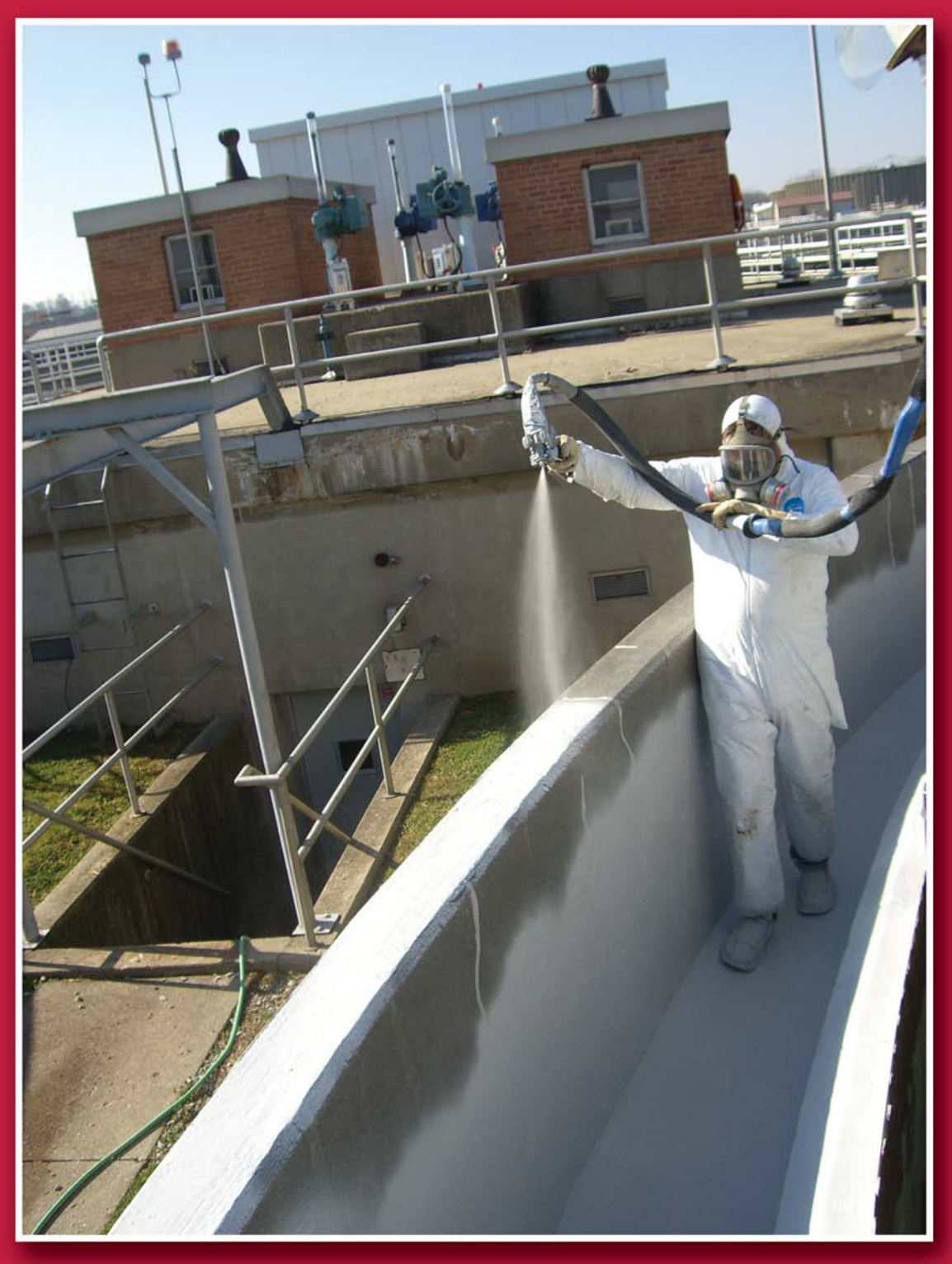
Pure Polyurea coating applied to secondary containment at a water treatment facility