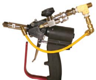
Probler P2 with Air Nucleation Kit

The Air Nucleation kit allows for air to be introduced with the mixing chemicals. The static mixer and air nucleation combine to provide additional mixing for pour and spray applications. The air nucleation atomizes the mix and helps create a usable spray pattern.