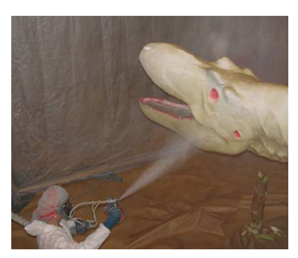
Polyurea Coating sprayed on foam and EPS