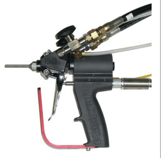
Probler P2 with Delayed Air Purge & Dispense Cycle Counter Option