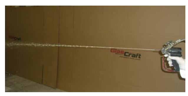
Stream Jet Application Up to 30' (10m)stream

The Stream Jet Nozzle is also a useful tool when filling difficult-to-access voids with foam. The Stream Jet Nozzle can quickly dispense the foam to the bottom or back of a cavity, enabling a complete full rise and full fill of insulation. Fold over and air cavities are completely eliminated.