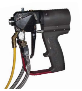
Probler P2 Elite with vertical hose configuration