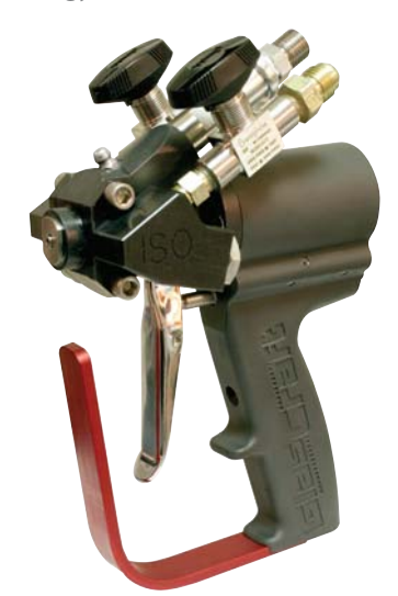
Standard Probler P2 (23950-XX) Probler P2 Flite (23940-XX)

Whether you are applying insulation foam, spraying bed liners, or spraying polyurea, the Probler P2 is the most reliable and consistent spray gun available today.