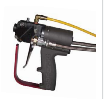
Probler P2 Elite with horizontal hose configuration

The Probler P2 Elite allows easy access to both the Iso & Poly filters without removing the sideblocks.