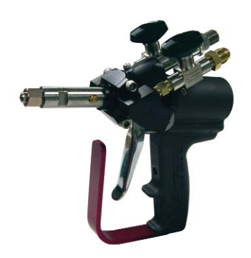
Probler P2 with Static Mixer

Many applications require additional mixing of the A and B materials in order to achieve optimal performance. This static mixer attachment can be used for spray, pour and injection dispensing.